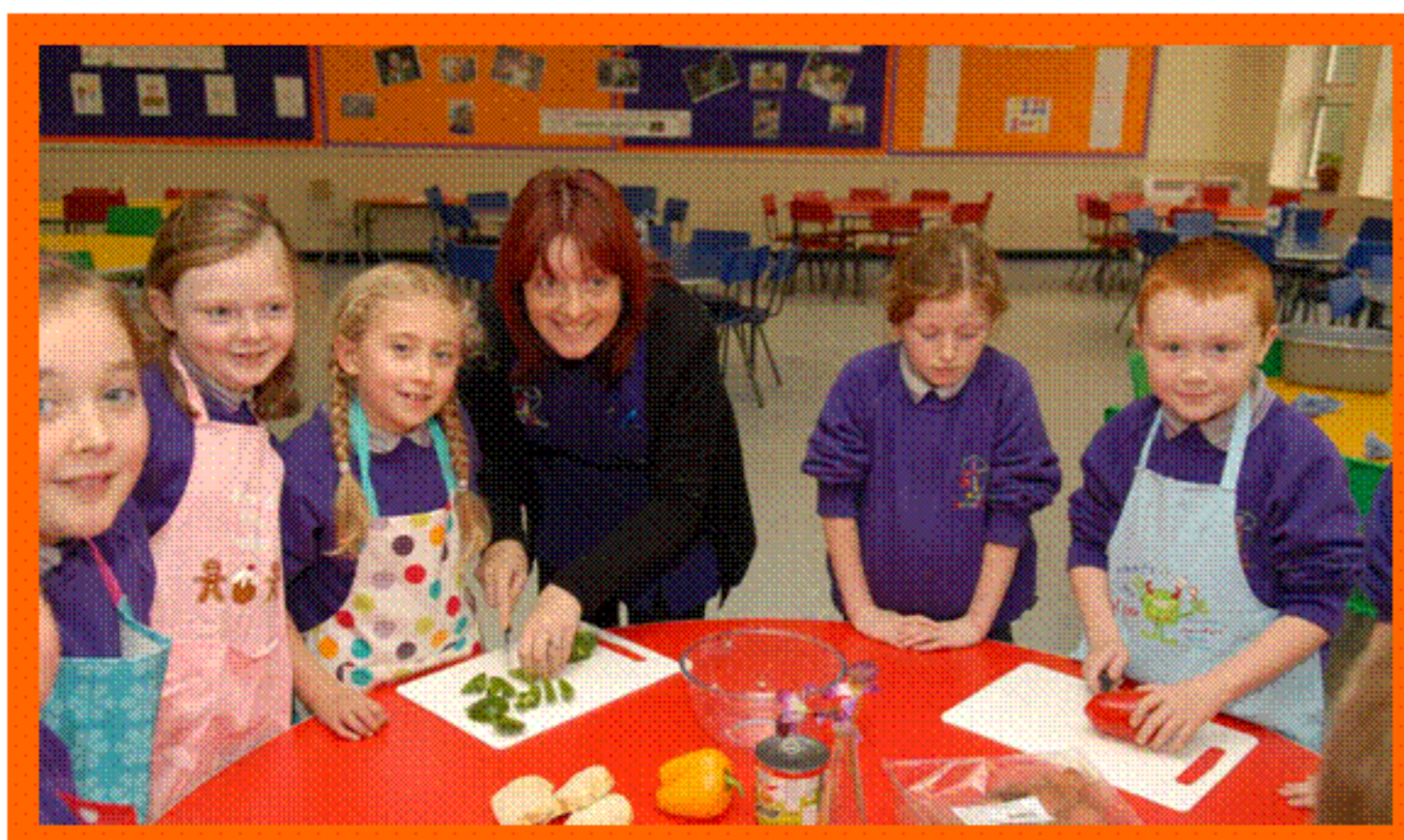
Master chefs of the future