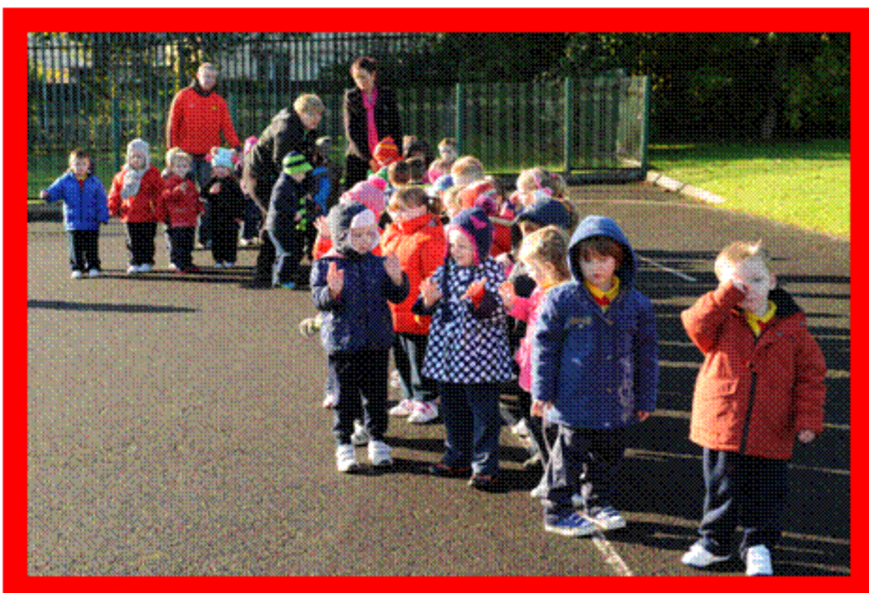
Children from the nursery taking part in the sponsored walk